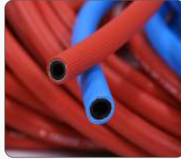
Thermoplastic Welding - Yasung Korea