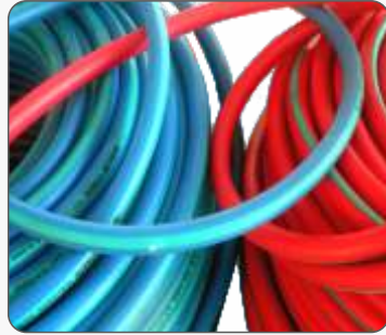
Thermoplastic Welding - Indian